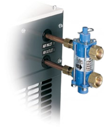
Air Bypass Valve