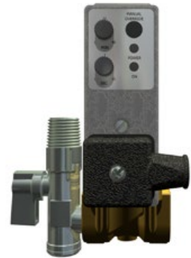
Adjustable Timed Electric Drain